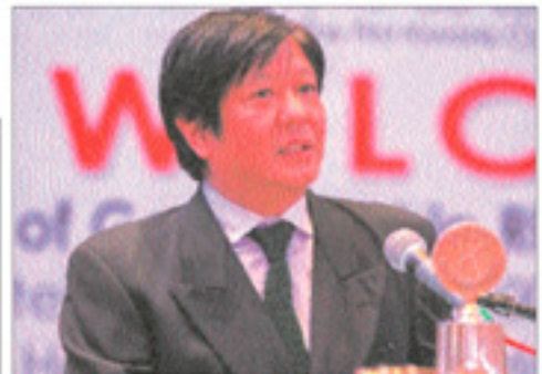
In this Sept. 24, 2015 photo, Sen. Ferdinand “Bongbong” Marcos Jr. delivers the keynote address at the Kivans Club of Manila’s event.