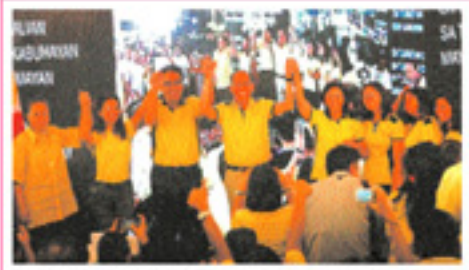
President Benigno Aquino III (center) raises the hands of Liberal Party presidential bet Manuel Roxas II and vice presidential bet Rep. Leni Robredo at Club Filipino on Oct. 5.