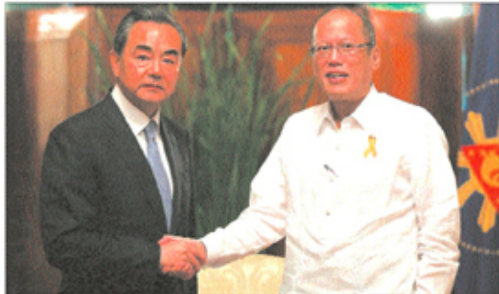
President Benigno Aquino III (right) welcomes Chinese Foreign Minister Wang Yi during a courtesy call in Malacanan on Nov. 18.

SEAT OF HONOR: The setup for the APEC Leaders' welcome reception at the MDA Arena on Nov. 18 evokes the World Heritage Banaue Rice Terraces, with the leaders seated around a multi-level stage accented with rice seedlings.